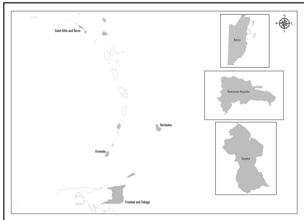
Figure 2 Sample of study

Thus, the sample of this work contains seven Caribbean SIDS ( Figure 2 ) for the period time 2005–2019. It includes both small developing insular societies with a high tourism GDP, as